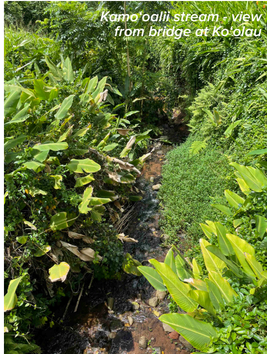
Kamo'oalii stream - view from bridge at Ko'olau

Spend some time in prayer thanking God for how He orchestrated everything from the creation of these islands to this very moment so we could be here today. Thank Him for those in our congregation who sacrificed in obedience and faith.