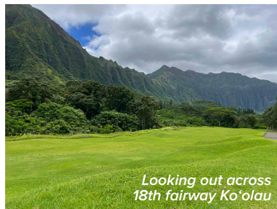
Looking out across 18th fairway Ko'olau