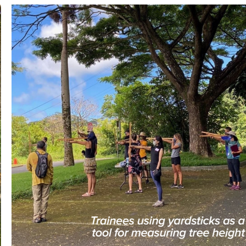
Trainees using yardsticks as a tool for measuring tree height